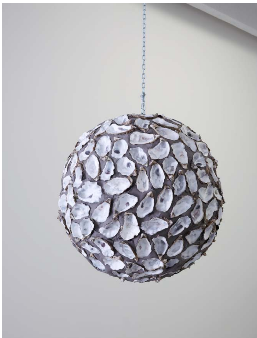
oyster ball, 2012

oyster shells, polystyrene, wood, putty diametre: 58 cm