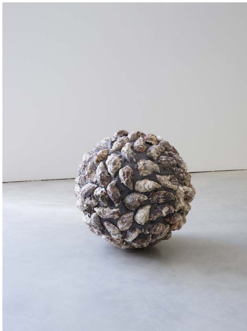
oyster ball, 2012

oyster shells, polystyrene, wood, putty diametre: 48 cm